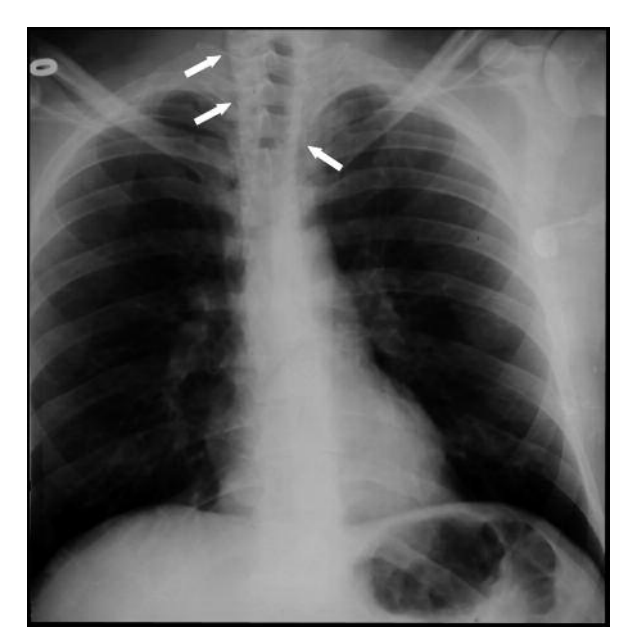
FIGURE 1: Chest X-ray on the day of accident.

at the same depth. He approached to his friend and took his extra regulator to share his air, when he was short of breath. After breathing several times, he left his friend and started to ascent. He ignored to exhale while ascending and he felt pressure increase in his thorax at 4-5 meters. Some air came out of his lung involuntarily when he was about to surface. He felt substernal pain, jerking and sensational change in the right lower extremity and right side of his body at surface. He could hardly be withdrawn to the boat and he felt weakness in his right lower extremity. He had dysarthria, which subsided within 10 minutes. His complaints almost completely disappeared within 30 minutes except the chest pain. An ambulance was available within 30 minutes and the treatment was set with oxygen administration with nasal prongs, dexamethasone 8 mg intramuscularly and infusion of electrolyte solution during the transfer to the hospital. At the hospital, tele-consultation with a diving physician was made and PBT was suggested as the presumptive diagnosis. Recompression treatment was recommended together with 100% oxygen administration during the transfer. A high-resolution computed chest tomography (HRCT) was recommended as well. The patient was referred to the nearest center for HRCT, which revealed normal results (Figure 1). The patient re-