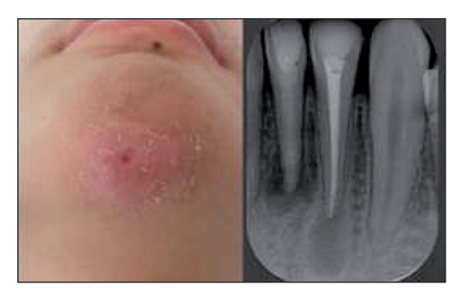
FIGURE 2: Preoperative photograpy and radiograph.

The sinus tract seen in the face and neck region can be treated with correct diagnosis and correct treatment selection. Differential diagnosis of sinus tracts include suppurative apical periodontitis, osteomyelitis, pyogenic granuloma, congenital fistula, salivary gland fistula, infected cyst and deep mycotic infection. It is expected that the sinus path will close within 7-14 days following the correct diagnosis treatment. 2-4.8