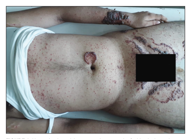
FIGURE 1: Hemorrhagic vesicles present in an annular fashion in the groin, near umbilicus and on left forearm along with discrete arrangement elsewhere on the body.