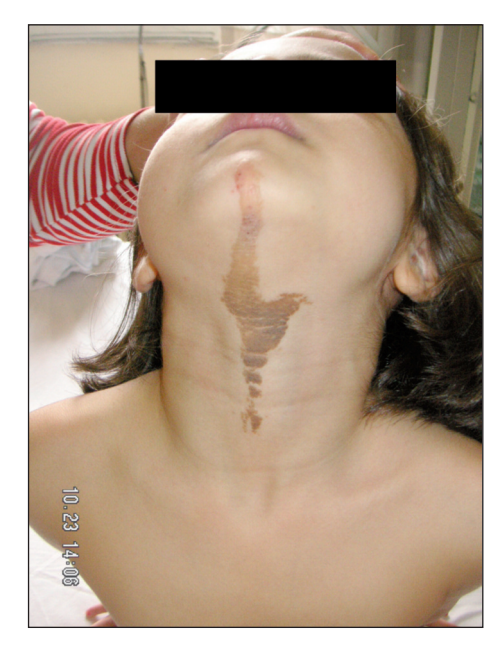
FIGURE 1: Yellow-brown, verrucosus plaque on the neck.

tory of late onset of gait. The patient's parents reported similar lesions in two family relatives of the patient.