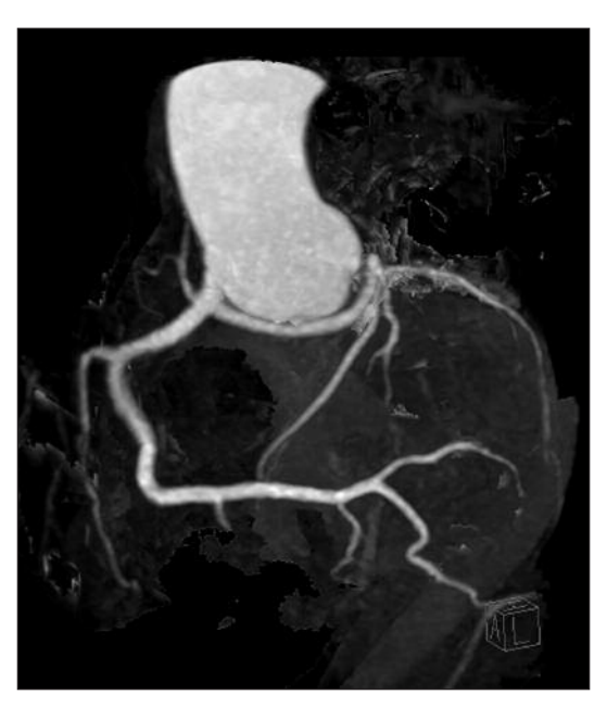
FIGURE 2: 3 D image of the coronary tree which originates from the right sinus of Valsava before bifurcating in the right and left coronary artery.

http://www.turkiyeklinikleri.com/journal/cardiovascular-sciences/1306-7656/)