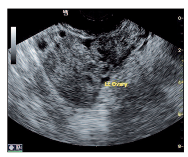
FIGURE 3: Normal appearance of the left ovary in control transvaginal USG.

Çetinkaya Demir ve ark. Kadın Hastalıkları ve Doğum