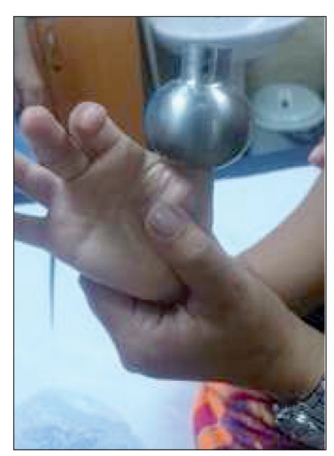
FIGURE 1: The patient who presented to the emergency ward after jamming his finger in the door knob.

Written and verbal informed consent were obtained from parents of our patient for the use of