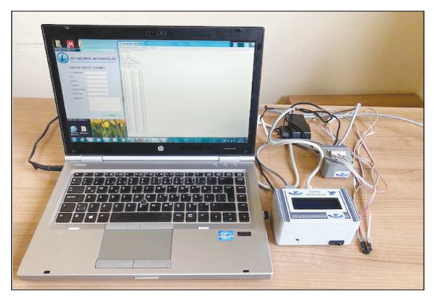
FIGURE 1: Digital heat measurement device, comprising 3 heat-sensitive sensors, a digital temperature indicator and computer software.