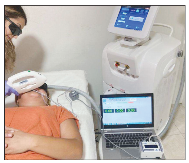
FIGURE 2: During laser application; digital measurement and recording of heat.

sured for 1 minute in this period were recorded (S1_{Max}, S2_{Max}, S3_{Max}) .