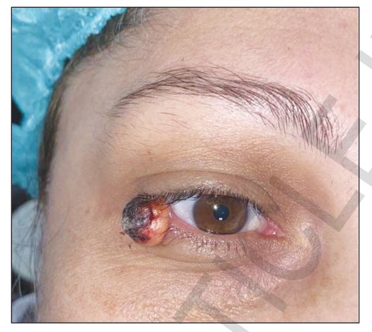
FIGURE 1: A round, elevated yellow-orange mass of approximately 1×1 cm in diameter, with well-defined borders on the lateral region of the right lower eyelid including eyelid margin.

The differential diagnosis included chalazion, sebaceous cyst, actinic keratosis, pyogenic granuloma and all types of eyelid malignancies. The patient underwent an excisional biopsy and the lesion was sent for histopathologic examination (Figure 2). Histopathology results indicated that the cells of the lesion were strongly positive with CD68, while Langerin, CD1A which are Langerhans cell markers, and S100 were negative, consistent with a diagnosis of JXG.