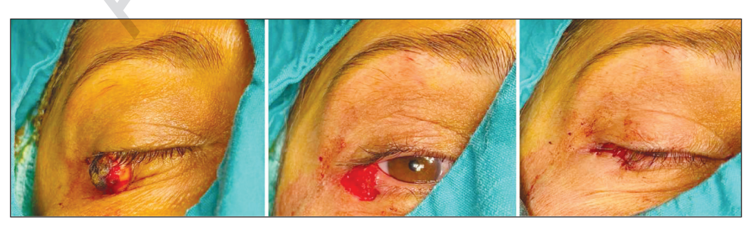
FIGURE 2: Intraoperative images show the excision of the mass and the suturing of the eyelid margin.

Clinically, juvenile and adult xanthogranulomas are most commonly observed on the skin and as a solitary lesion. In a study that analyzed 13 cases of JXGs on the eyelid, the median age at which the disease manifested was 9 years (range: 1.2-47.0).9 Within the same study, an additional 19 eyelid JXG