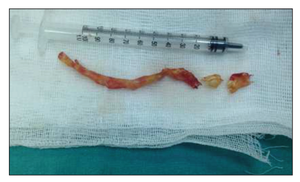
FIGURE 2: Material obtained after long segment open endarterectomy to right coronary artery.

low-molecular-weight heparin treatment was continued together with oral treatment after transferring the patients out of the intensive care unit (ICU). After discharge, anti-coagulant therapy was implemented two months in addition to antiaggregant treatment. The internationalized normalized ratio was kept between 2-2.5 during anticoagulant therapy.