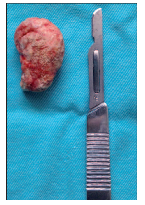
FIGURE 4: Macroscopic view of the 30 mm sized submandibular megalith.

may reveal the calculus. Ultrasonography is widely used the least invasive method and 90% of all stones larger than 2 mm in diameter can be detected as echodense spots on ultrasonography.<sup>4</sup> Sialoendoscopy has been introduced as a minimally invasive surgical procedure for the diagnosis and treatment of salivary ductal diseases. With the advantages of this new technique, clinicians can visualize the duct lumen and the pathologic features, making the diagnosis according to the endoscopic findings.<sup>13</sup> By injecting radiopaque dye into salivary glands, orifice sialography can display radiolucent calculi as filling defects. Application of sialography is restricted and contraindicated in acute infectious manifestations. By applying high-resolution imaging protocols with slice thicknesses of 0.2 to 0.5 mm, 3D medical CT can successfully display even the smallest or semicalcified calculi. MRI is reported to be a valuable additional diagnostic method in difficult cases, or when further soft tissue diagnosis is necessary.<sup>14</sup> Dreiseidler et al. stated that diagnostic sensitivity and specificity levels