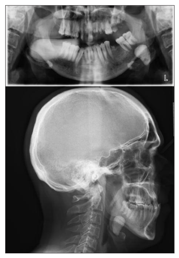
FIGURE 1: Two-dimensional cephalometric and panoramic images showing megalith.

The mass was palpable intraorally so a staged transoral sialolithotomy approach was planned and performed after induction of local anesthesia and a cylindrical, hard, yellow 30 mm long specimen was obtained (Figure 4).