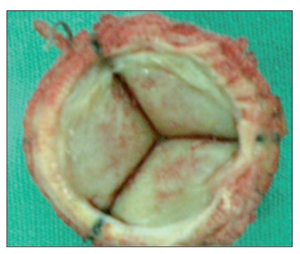
FIGURE 3: Posterior exposure of excised bioprothetic valve. (See color figure at http://cardivascular.turkiyeklinikleri.com/)

The patient was treated with regular anticoagulant therapy in the postoperative period. And, full functional mechanical valve was identified in his echocardiography report in the 6<sup>th</sup> postoperative month. The patient is still normal for cardiac functions and has no complaints.