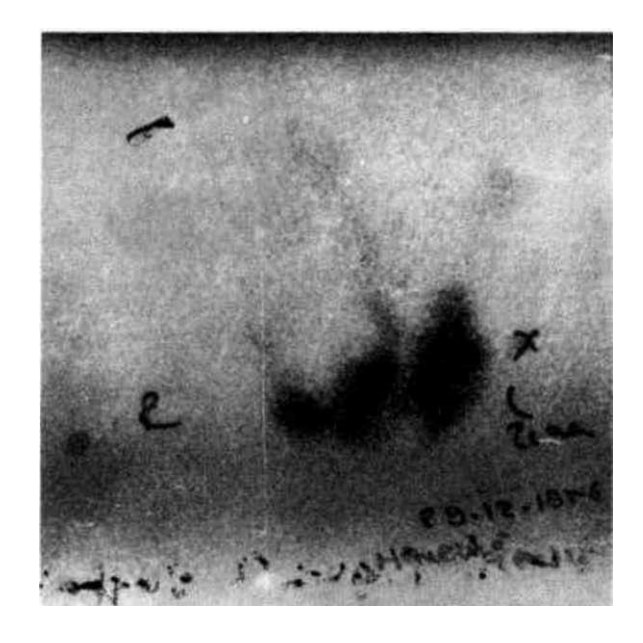
Figure-1. A hypofunctioning nodule in the right lobe seen on thyroid scan.

was definitely made. Then, the fluid was aspirated and the cyst was evacuated. Sodium chlorure, at the concentration of 3 per cent, was given into the cystic cavity as a scolicidal agent. Soaked sponges with 3 per cent sodium chlorure were used in order to prevent the adjacent tissues from contamination. Later on, right total and left subtotal thyroidectomy was performed (Figure 2). Hydatid cyst of the thyroid gland and nodular hyperplasia were, then, reported as the certain pathologic diagnosis by the Pathology Department of the Numune Hospital (Path.No.46/1987) (Figure-3).