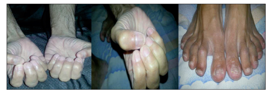
FIGURE 3: Patient's nails after 4 doses of chemotherapy.

consequence of an increase in the number of cases of immunodepression and environmental changes, more attention has been given to this wide, but generally non-pathogenic group of fungi.<sup>11</sup>