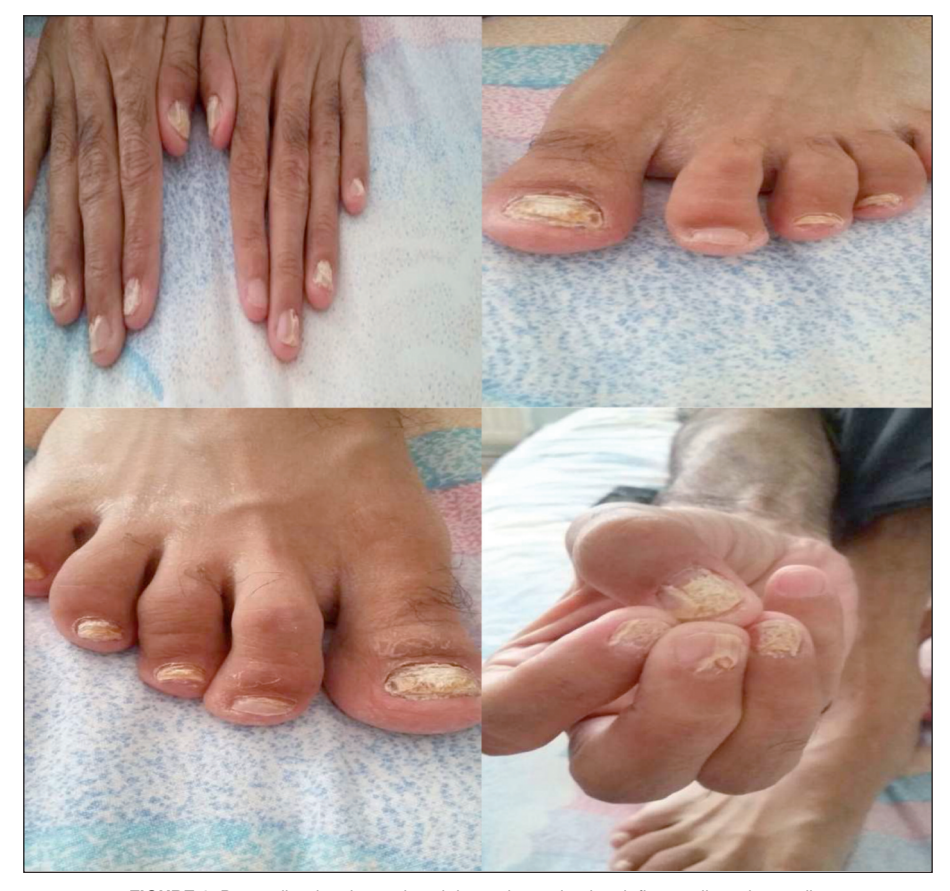
FIGURE 1: Brown discoloration and total dystrophy on the thumb fingernails and toe nails.

A direct mycological examination was performed with 10% potassium hydroxide preparation (KOH), and fungal structures such as arthrospores and hyphae were considered as conferring positivity in the direct examination. The patient's fingernail specimen was planted in appropriate media. After a certain period of time the cultures of the fingernail yielded greenish-yellow to olive colored, velvety to woolly colonies . Microscopic examination of the lactophenol cotton blue stained colonies indicated long conidiophores with spherical to elongate vesicles surrounded by uniseriate