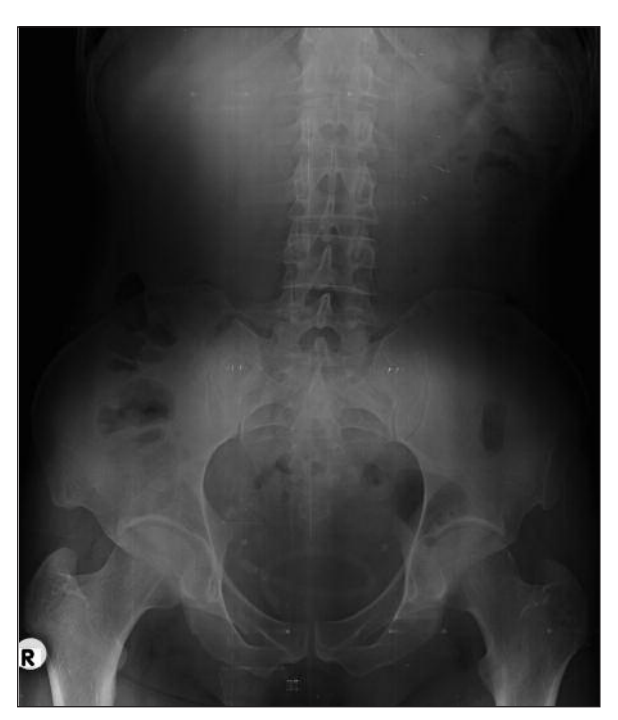
FIGURE 1: Kidneys-ureters-bladder radiograph showing entrapped foreign body twisted in bladder.

Self-inserted foreign bodies into the penile urethra have been reported in varying age groups of