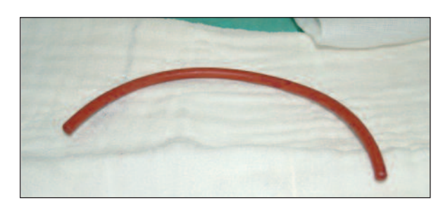
FIGURE 2: Rigid long catheter-like foreign body with blunt rounded ends without any lumen within the body.

(See color figure at http://www.turkiyeklinikleri.com/journal/uroloji-dergisi/1309-632X/)