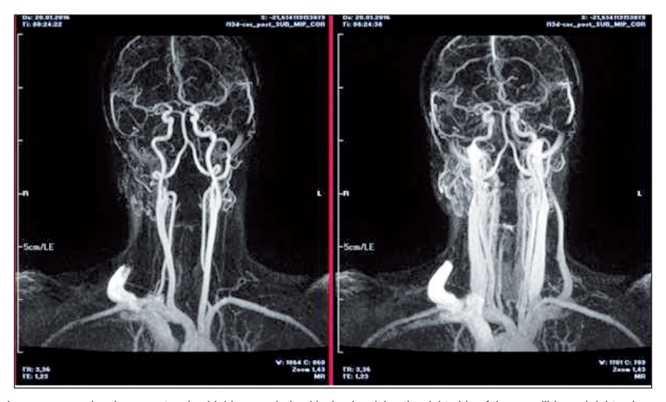
FIGURE 4: MR angiogram scans showing an extensive highly vascularized lesion involving the right side of the mandible and right submandibular region. The presence of several arteries feeding the vascular lesion.

Surgical procedures for the resection of the AVM lesion was made by a plastic, reconstructive and aesthetic surgeon (DI). Selective embolization with 150 to 350 \mu m polyvinyl alcohol (PVA) particles was performed in preparation for surgery. Hypotensive general anesthesia was made providing systolic pressure of approximately 70mmHg. The patient was intubated for airway protection on an emergency basis. After preoperative embolization, a submandibular incision was performed. Dissec-