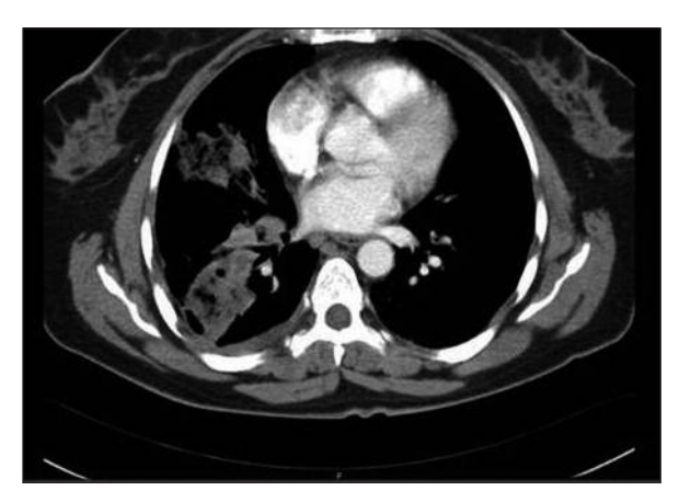
FIGURE 3: Chest computed tomography scan showing infarct area in the right lung.

change was observed in both the infarct size and thrombus image in the right pulmonary artery in the CT scan. In the follow-up period, we observed significant improvement in her clinical status, under effective oral anticoagulation therapy. Control chest CT scans showed progressive resolution of the thrombus and marked decrease in the infarct size. At the end of 10 months, thrombus seemed to be totally removed from the pulmonary artery.