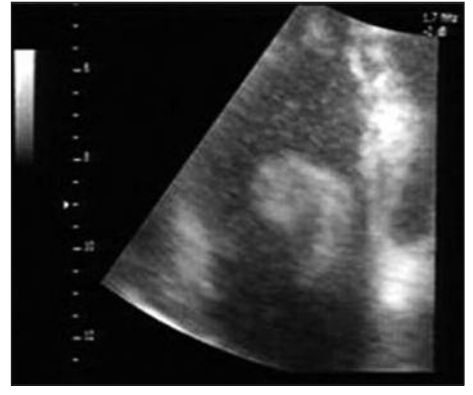
FIGURE 1: Transthoracic echocardiography showing right atrial mass.

50 year-old female presented to our hospital with symptoms suggestive of pulmonary embolism (PE). Ten days before her presentation, a huge free-floating mass with a smooth surface which prolapsed into the right ventricle in every diastole, was obtained in the right atrium (RA) by transthorasic echocardiography (TTE) in another center (Figure 1). There was no RA mass in TTE and transosephageal echocardiography (TEE) images. Bilateral lower limb venous Duplex examination was unremarkable. We suggested that RA mass was a thrombus which had totally embolized to right pulmonary artery. A big thrombus image in the right main pulmonary artery and large infarct areas in the medial and inferior lobes of the right lung were demonstrated in the chest computed tomography (CT) (Figure 2, 3).