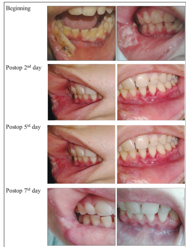
FIGURE 1: Intraoral view of lesions over time.

The histopathological examination of the biopsy sample obtained from the relevant region diagnosed