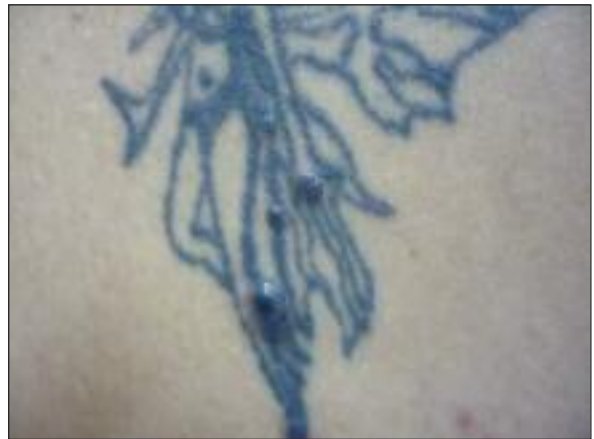
FIGURE 1: Nodules on the tattoo.

The association between tattoos and sarcoidosis is not so clear and it raises some questions need to be answered: whether the systemic sarcoidosis manifests itself at first on the scar area 6 or dyes of tattoo serves as a trigger for development of the sarcoidosis. In some cases, dyes of tattoo seem to play a role in the etiology. Tattoo-induced systemic sarcoid reaction has been demonstrated by showing