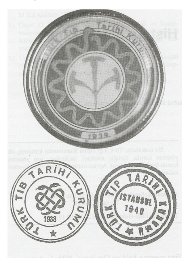
Figure 1. Rosettes and seals of the Turkish Society for the History of Medicine (from the past to today)

and Studies of Medical History. For the first time the Society for the History of Medicine was located in a room and a sign was hung on the door. The society has continued its studies and activities from this center since 1984.