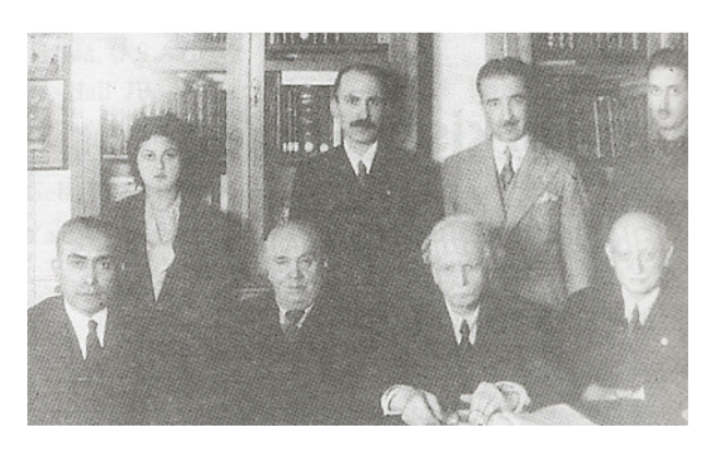
Figure 2. Founder members of the Turkish Society for the History of Medicine

Foreign scientists who are interested in medical history may be members by decision of the executive committee, if they apply to the society's secretary.