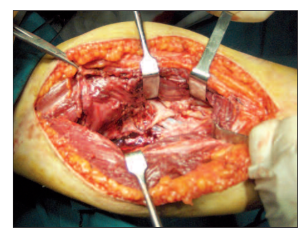
FIGURE 2B: Anterior cyst wall and its close relation with neurovascular structures. (See for colored form http://tipbilimleri.turkiyeklinikleri.com/)