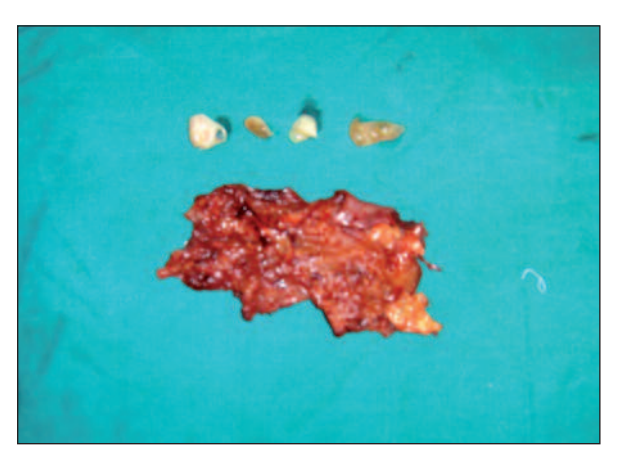
FIGURE 2C: Cyst wall and the cysts after excision. (See for colored form http://tipbilimleri.turkiyeklinikleri.com/)

In our case, the disease presented as a mass in the deep posterior crural compartment and soleus muscle. To our knowledge, this is the first case presented at this location. casein addition, the mass surrounded the posterior neurovascular structures in our