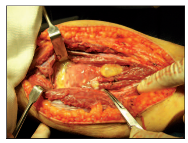
FIGURE 2A: Posterior cyst wall and a cyst. (See for colored form http://tipbilimleri.turkiyeklinikleri.com/)

Orthopedics and Traumatology Ünal et al.