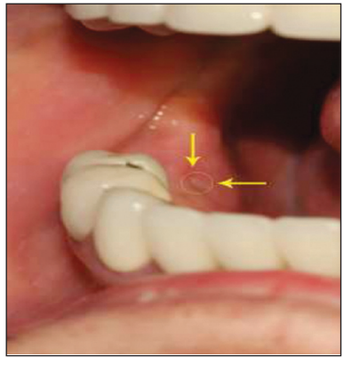
FIGURE 1: Presence of fistula in the right mandible.

A 63-year-old woman was referred to the Istanbul University Dentistry Faculty Department of Prosthodontics for the evaluation of right mandibular pain and swelling. In 2012, the patient was diagnosed with osteoporosis, and intravenous BP therapy (zoledronic acid) was initiated as a preventative treatment. During anamnesis, hypertension was also reported. Two years after BP treatment, the patient had a removable partial denture, and an ulceration had developed in the right mandibular lingual gingiva. An adjustment of the prosthesis by her dentist did not solve the issue. Thereupon, the patient discontinued the use of her prothesis, and 3 years later, she was referred to the authors with the same complaints. The clinical examination showed swelling and purulent secretion on the right posterior mandibular area (Figure 1). Panoramic radiographs showed radiolucent areas in the same region (Figure 2).