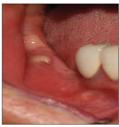
FIGURE 4: Four months later, a fistula was observed in same region.