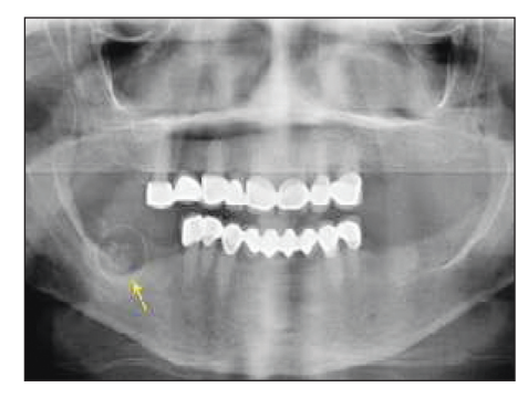
FIGURE 2: Panoramic radiography showed the affected area.