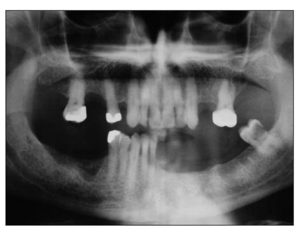
FIGURE 5: Panoramic x-ray after 22 months. Teeth 31,32,33,34 were extracted during the operation.

Smokeless tobacco products can cause oral mucosal lesions, gingival recession, squamous cell carcinoma, verrucuos carcinoma, leukoplakia, and erythroplakia and they may play a role in the development of cardiovascular disease, peripheral vascular disease, hypertension and peptic ulcers.