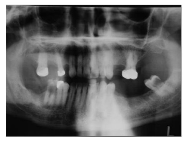
FIGURE 3: Panoramic x-ray before treatment. Horizontal bone loss especially around right maxillary molars. No bone loss around left mandibular premolars (tumor region).