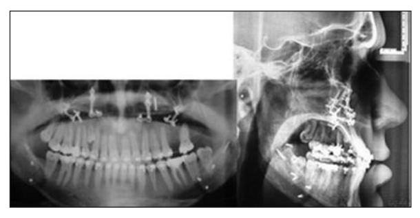
FIGURE 6: Radiographs after surgical phase.

Following the surgery, settling was accomplished with light round wires and vertical elastic mechanics. The patient's cephalometric analysis were re-examined (Figure 6, Table 1). The treatment was concluded in 18 months. Immediately after the removal of the fixed appliances, essix retainers were placed, and the patient was asked to wear them full time for 6 months and at night thereafter