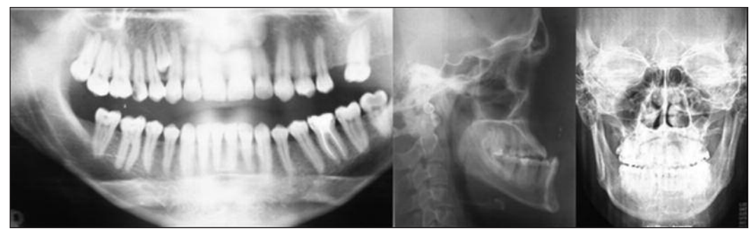
FIGURE 3: Pre-treatment-radiographs views.