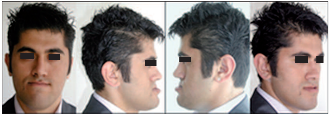
FIGURE 1: Pre-treatment extraoral views. (See for colored form http://dishekimligi.turkiyeklinikleri.com/)

Intraoral examination revealed a Class III malocclusion with an excessive negative overjet. Oral hygiene was fair and the patient has generalized marginal gingivitis. The frenal attachments were normal and the tongue was of normal size and function. The maxillary and mandibular arch forms were U-shaped and moderate anterior crowding was observed (Figure 3).