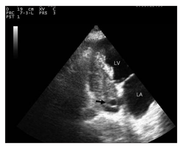
FIGURE 2: Transthoracic echocardiography in modified apical four chamber view with agitated saline. Note the absence of microbubbles in cystic cavity (arrow).

tion as a sequel of endocarditis, hydatid cyst, cavitating thrombus and blood cyst.6 For detecting of the intracardiac mass, echocardiography is the most important technique,1 because of various mass exhibit different findings. For example, myxomas tend to be heterogeneous and they always exhibit contrast uptake.7 Blood cysts are seen as a well-circumscribed homogenous mass with a thin wall and echolucent core.<sup>2</sup> In addition, they usually exibit no contrast uptake into echolucent central core.7 The hydatid cysts tend to be large, thin walled and septaled. Also, they are generally located in the left ventricular free wall.8 The right-sided thrombus is usually mobile and have a snake-like or popcorn apperance as a characteristic finding. Also, they almost always are associated with pulmonary embolism. Whereas, torax CT of our patient was normal.