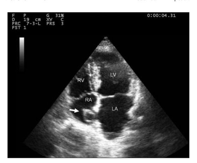
FIGURE 1A: Transthoracic echocardiography in apical four chamber view showing blood cyst (arrow) attached to the right interatrial septum. LA, left atrium; LV, left ventricle, RA, right atrium; RV, right ventricle.

Intracardiac blood cysts are generally observed in infants and disappear during the first six months of life. Therefore, they are rarely seen in adults. The