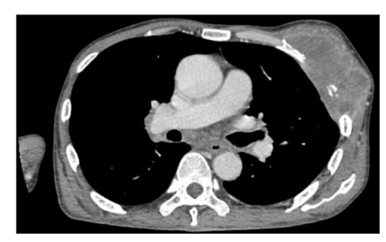
FIGURE 2: Contrast enhanced CT of the thorax showing a lobulated, heterogeneously enhancing mass occupying the whole left breast measuring 11.1x4.7x9.2 cm with ribs erosion and intrathoracic extension.