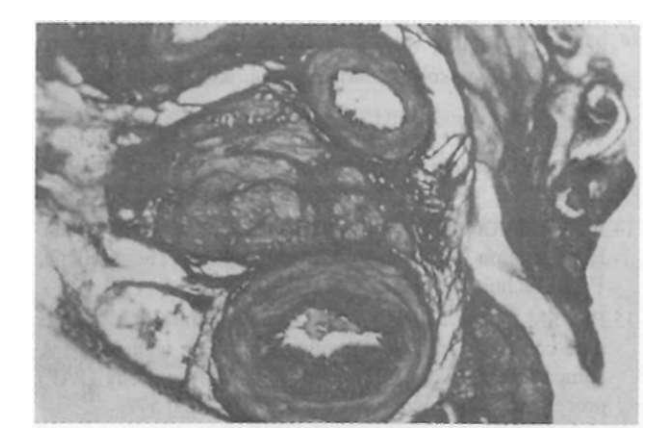
Figure 3. Spiral artery with medial hyperplasia (VGx50).