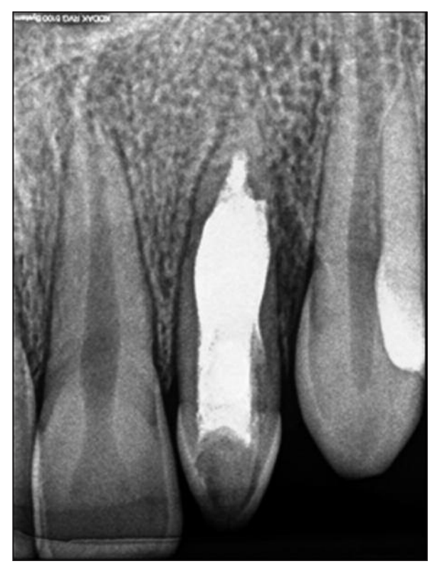
FIGURE 3: Radiograph after root canal filling.