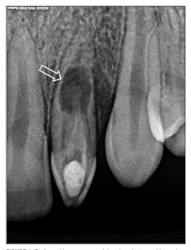
FIGURE 1: Radiographic appearance of dens invaginatus and internal resorption in left maxillary lateral incisor tooth.