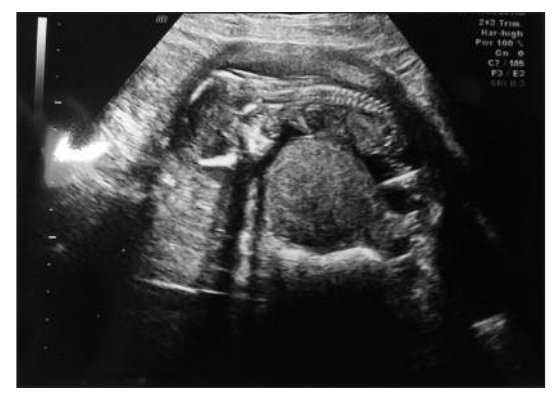
FIGURE 1b: Fetus in a 32 year old woman.