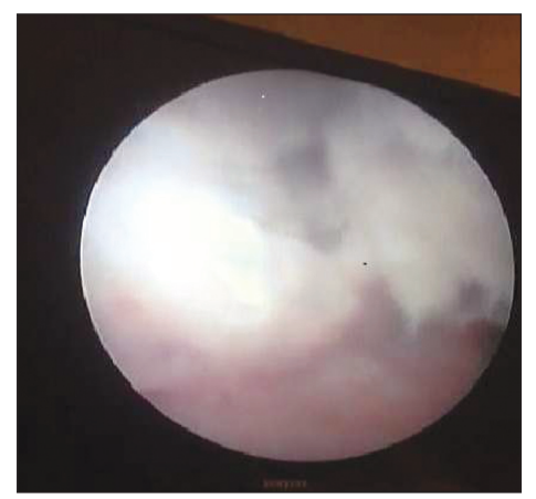
FIGURE 2: Endometrial polyp after surgery.

Hysteroscopic resection of EPs with a loop electrode has been a useful and reliable procedure for surgeons. Hysteroscopic resection with a loop electrode needs a large diameter of a hysteroscope (7-9 mm outer diameter). Hysteroscopic morcellation procedure uses smaller diameter hysteroscopes (3-4 mm outer diameter). Using a small diameter of hysteroscope causes less cervical dilatation, less pain, and less anesthesia.<sup>7</sup>