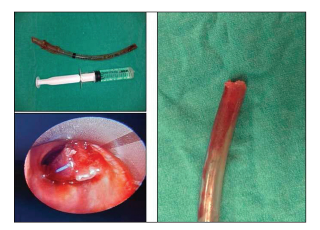
FIGURE 2: Bronchoscopic view of the broken endotracheal tube located in subglottic area and images after removal.

vocal cords and removed by forceps subsequently. It was partially obstructed by bloody sputum (Figure 2). The postoperative course was uneventful.