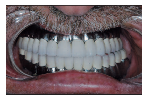
FIGURE 5: Fabrication of metal-ceramic restoration over metal substructure.