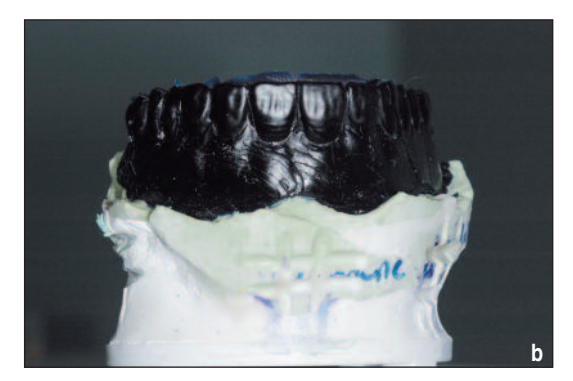
FIGURE 3a,b: Duplication of upper rim with modeling wax.