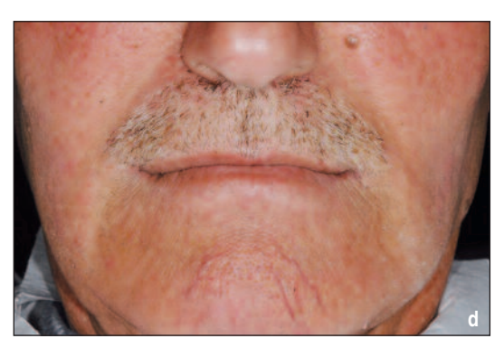
FIGURE 2c,d: Improved lip and cheek support and optimal occlusal vertical dimensions (OVD) from profile and frontal view.

for easy removal of metal-ceramic crown in case if needed (Figure 6). Occlusion was adjusted to mutually protected occlusion. The buccal of the metal substructure was covered with a pink composite resin (Gradia, Gc, Alsip, IL, USA) to mimic soft tissue (Figure 7).