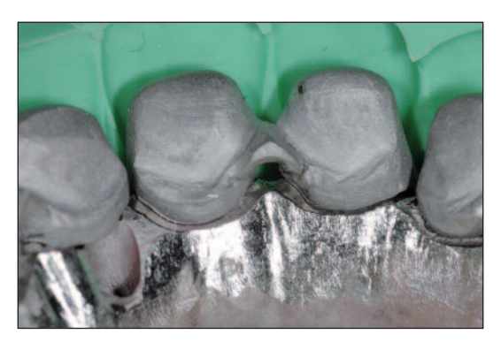
FIGURE 6: Small notches for housing of the tip of crown remover.