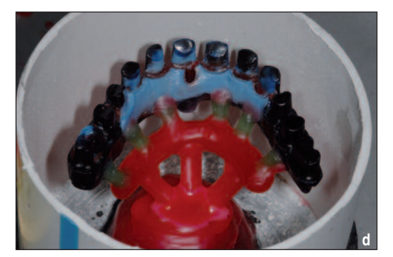
FIGURE 3c,d: Reduction of wax model and spruing.

The soft tissue support, proper occlusion and aesthetics could be achieved in cases of extensive resorption with implant retained removable dentures. Despite economical disadvantages and difficulties in encountering hygiene, hybrid fixed dentures are superior compared to the implant retained removable dentures in term of chewing efficacy and comfort.<sup>6</sup> In the current report the patient had been using removable dentures for many years and demanded fixed dentures.