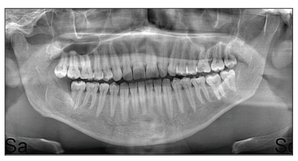
FIGURE 4: Radiographic image-2 years after the surgical removal of the lesion.

extracted and the lesion was enucleated. Peripheral osteoctomy was done after enucleation. Histopathological evaluation of the enucleated lesion was the same as the first sample. After 2 years, it was observed that the lesion disappeared and no recurrence was occurred (Figure 4).