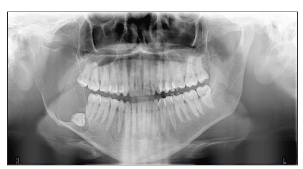
FIGURE 1: Radiographic image of unicystic ameloblastoma before decompression.

Routine radiographic follow-up was made during decompression (Figure 3). After 8 months, the impacted wisdom tooth in the shrunken lesion area was