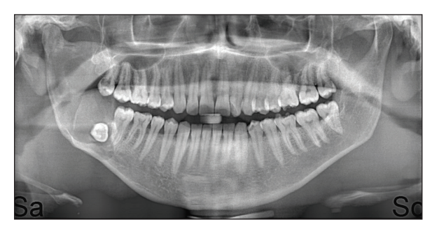
FIGURE 3: Radiographic image of the lesion-3 months after decompression.