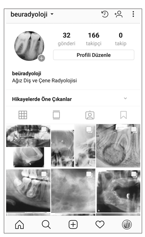
FIGURE 1: Instagram account named @beuradyoloji opened for this study.

Students (n=21) in the study group were told to follow the newly opened @beuradyoloji account on Instagram (Figure 1). The same images of the odontogenic and non-odontogenic cysts and odontogenic tumors described in the control group during