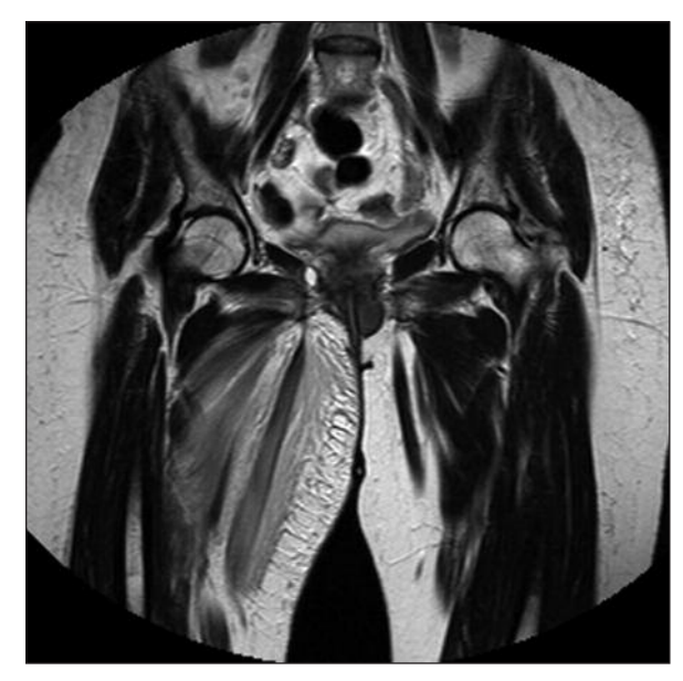
FIGURE 1: Post–gadolinium T2–weighted coronal magnetic resonance image demonstrates expansion of the lesion.

attachments of the adductors of the thigh, with the base of the triangle along the medial aspect of the femur. Magnetic resonance imaging scan was performed in order to delineate the anatomic borders of the abscess formation in the pelvic region unilaterally. The images were characteristic for cellulitis and abscess formation (Figures 1, 2). Additionally, there was no evidence of vaginal erosion. Moreover, bacteriological cultures did not yield any pathogen. When the fluctuation was obviously formed on the 10<sup>th</sup> day, the abscess was drained completely by an incision on the skin under local anesthesia.