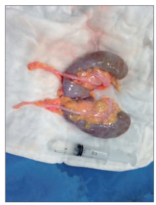
FIGURE 1: Horseshoe kidney on the back table after harvesting.

Standard immunosuppressive treatment was administered to both recipients. After transplantation, sufficient urine output was obtained in the first recipient and there were no significant adverse events during postoperative follow-up. The patient was discharged when the creatinine level became normal. The second recipient developed acute tu-