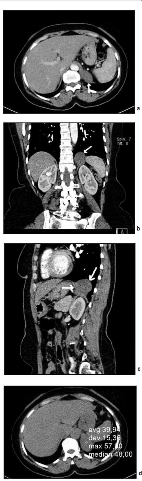
FIGURE 2: An axial (a), coronal (b) and, sagittal (c) contrast enhanced CT images showed left diaphragmatic mass (arrows). The density of mass was higher than that of water in axial nonenhanced CT image (d).