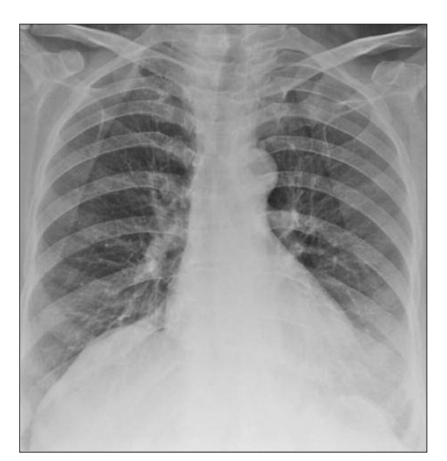
FIGURE 1: Chest roentgenogram was normal.

The patient was thus referred to surgery for resection of a presumed left diaphragmatic benign lesion. A posterolateral thoracotomy was performed with complete resection of tumor from the diaphragm (Figures 3a-b). Histopathologic examination of surgical specimen revealed bronchogenic cyst (Figures 4a-b).