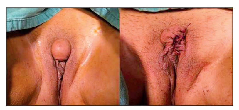
FIGURE 2: The appearance of the clitoral mass from the operating room.