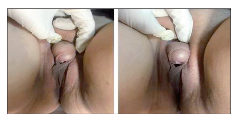
FIGURE 1: The macrosopic appearance of the clitoral mass.

Informed consent was obtained from the patient, allowing the use of her blinded clinical data for research purposes.