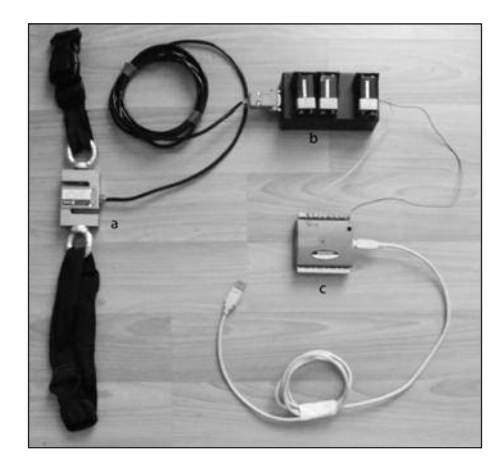
FIGURE 1: Force transducer; a: loadcell and its mounting kit, b:amplifier, c: DAQ card.

Calibration was done by a reference electronic dynamometer with 20 gram sensitivity (Dikomsan DGC 50, Istanbul/Turkey).