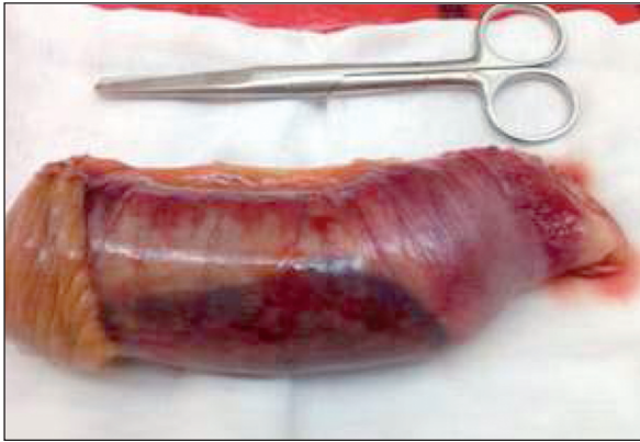
FIGURE 2: The mass was resected from the proximal and distal sides together with a solid border of 10 cm.