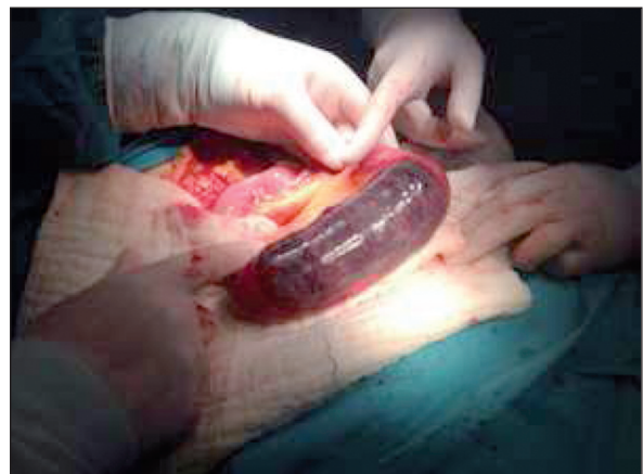
FIGURE 1: A smooth surfaced mass with a length of about 20 cm filling nearly all of the small intestine lumen.

Hemangiomas are microscopically classified as capillary, cavernous and mixed type, the most commonly encountered being the cavernous type. 3 Cavernous hemangiomas are seen as areas surrounded by endothelial tissue filled with blood. 2,4 Intestinal cavernous hemangiomas are mostly located in the upper and lower gastrointestinal levels, whereas small intestinal location is rare. The main clinical presentation of intestinal hemangiomas is gastrointestinal bleeding, with cavernous hemangiomas causing more severe and acute hemorrhages, whereas capillary hemangiomas cause occult blood loss. 1,2,5 Other clinical presentations may be in the form of obstruction, intussusception, intramural hematoma, perforation, and platelet sequestration. 3,5 The size of cavernous hemangiomas is often less than