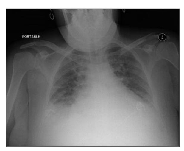
FIGURE 1: Chest radiogram shows enlarged cardiac silhouette and bilaterally sinuses were effaced.

A 52-year-old woman admitted to our hospital with a history of fatigue and progressive dyspnea. She had these complaints for one week and has been worsen over last two days. She has no history of any known diseases, no smoke, no alcohol use, no any medications. On physical examination her blood pressure was 150/90 mmHg, heart rate was 84/minute, respiration rate was 32/minute and body temperature was 36.9°C (98.42°F). There was jugular venous fullness, heart sounds and pulmonary sounds at the bases of lungs were attenuated. On electrocardiography, atrial fibrillation and low voltage were seen. On chest radiogram, an enlarged cardiac silhouette was seen and bilaterally sinuses were effaced (Figure 1). Because pericardial effusion suspected, echocardiogram was performed and it revealed massive pericardial effusion of 2.2 cm near by the posterior wall of left ventricule (Figures 2,3), ejection fraction of 60 percent, 2-3 degree tricuspid valve insufficiency, and pulmonary artery blood pressure of 50-55 mmHg. Because of progressive respiratory distress, a percutaneous drain was placed echocardiographically. Initially 1200 mL exudative, hemorrhagic fluid was removed. At the admission, laboratory