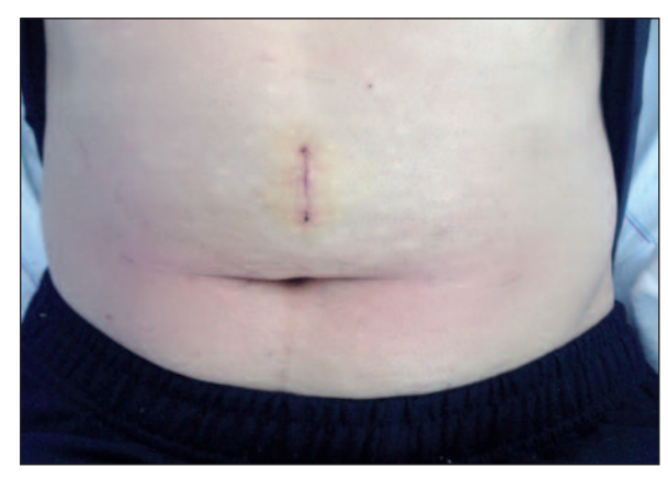
FIGURE 2: Vertical midline incision above the umbilicus. (See color figure at http://tipbilimleri.turkiyeklinikleri.com/)

(See color figure at http://tipbilimleri.turkiyeklinikleri.com/)