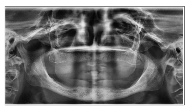
FIGURE 1C: Fibro-osseos lesion in the right mandible.