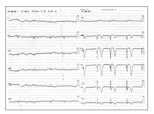
FIGURE 1: First case's ECG at second admission showing bradycardia and giant T wave inversion in leads V2-V6.

An 81-year-old man was admitted with a severe retrosternal chest pain which had started one hour before admission. The pain had an acute onset, progressive course and a compressing nature. History revealed tobacco use. His initial heart rate was 63 beats/min; blood pressure was 110/70 mmHg. Cardiac examination revealed normal S1, S2 and the rest of the physical examination was normal. Twelve-lead electrocardiography (ECG) showed elevated ST-waves in leads V2-V5. The diagnosis of acute anterior myocardial infarction (AMI) was concluded and the patient was admitted to catheterization laboratory for primary percutaneous coronary intervention (PCI). Coronary angiogram showed total occlusion of left anterior descending (LAD) artery. Reperfusion was stored with LAD artery stenting. After PCI, ECG showed slight ST-wave elevation in leads V2-3 and T wave inversion in leads V2-6, D1, D2 and aVL. His hospital stay was uneventful and he was discharged with ACE inhibitor, beta-blocker, aspirin and clopidogrel therapy. Two weeks later, at his follow-up in outpatient clinic, his ECG revealed bradycardia and giant T wave inversion in the same leads at discharge (Figure 1). He had complaint of dizziness. Cardiac enzymes and electrolytes were normal. Echocardiography revealed anterior hipokinesia, an ejection fraction of 45%