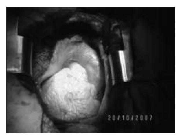
FIGURE 3: Malposition of the heart.

The patient was informed about the anomaly and a written consent was obtained from the pati-