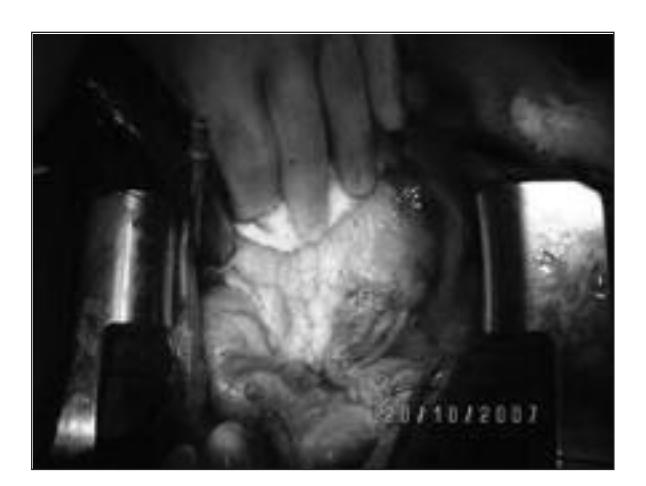
FIGURE 4: LAD and first diagonal anastomosis.