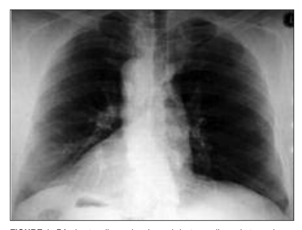
FIGURE 1: PA chest radiography showed dextrocardia and stomach gas was presented at the right side.