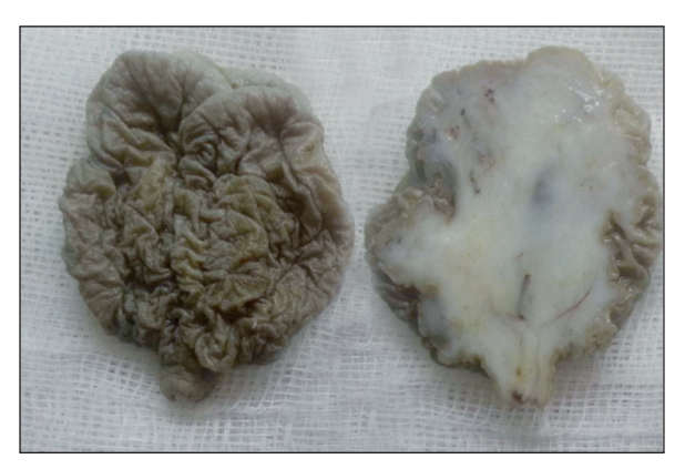
FIGURE 2: A polypoid mass with a size of 5.5x4.5x3.5 cm. The cut surface was soft and fleshy, white in color with focal milimetric dark red areas.