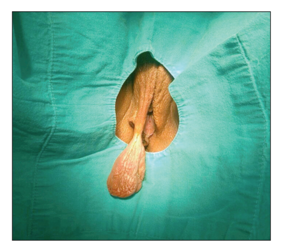
FIGURE 1: A flesh colored, large pedunculated mass on right labium majus.

Upon examination, she was referred to the gynaecology outpatient clinic. The patient admitted that she first noticed a bump on her vulva 2 years ago which has been growing gradually. History did not reveal any chronic diseases or previous operations. Physical examination revealed a pedunculated mass on her right labium majoris which has a diameter of approximately 6 cm (Figure 1). There was no tenderness or pain on palpation of the mass area. The patient did not have any accompanying polypoid mass on skin of any other body region. According to vaginal examination, uterus was in normal size and adnexes were non-palpable, bilaterally. Ultrasonography did not reveal any abnormalities in the internal genital tract. The patient had a high Body Mass Index (BMI) of 35.5 which indicated her to be categorised as obese. Complete blood count and biochemical analysis were in nor-