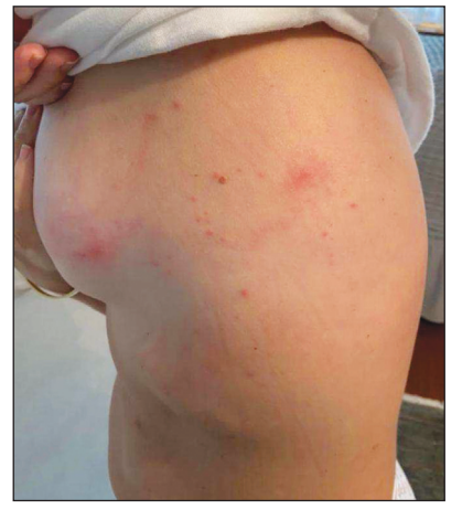
FIGURE 2: A 32 year old female patient, erythematous, maculopapular eruption on her trunk.