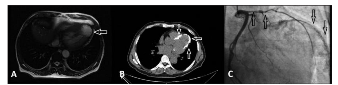
FIGURE 1: A) MRI image (aneurysmal sac), B) CT image, C) Coronary angiogram (LAD proximal lesion and calcification line).

A standard median sternotomy was performed under general anesthesia. A left internal mammary artery (LIMA) graft was prepared. After opening the pericardium and suspending it, the patient was heparinized. Arterial cannulation from the ascending aorta and two-stage venous cannulation from the right atrium were performed. After cannulation, cardiopulmonary bypass (CPB) was initiated at the appropriate activated clotting time. Using a cross-clamp, cardiac arrest was induced via isothermic hyperkalemic antegrade blood cardioplegia. A large calcified aneurysm was seen involving a large area of the LV apex (Figure 2A). A ventriculotomy was performed and sutured internally with a 4×3 cm Dacron patch. Then the opened aneurysm was closed externally using the Dor procedure with Teflon felt (Figure 2B, 2C).<sup>2</sup> Subsequently, an LIMA-LAD distal anastomosis was performed. The cross-clamp was removed, and the CPB was gradually ended with inotropic support. The patient was transferred to the intensive care unit and discharged without any problems on the seventh postoperative day.