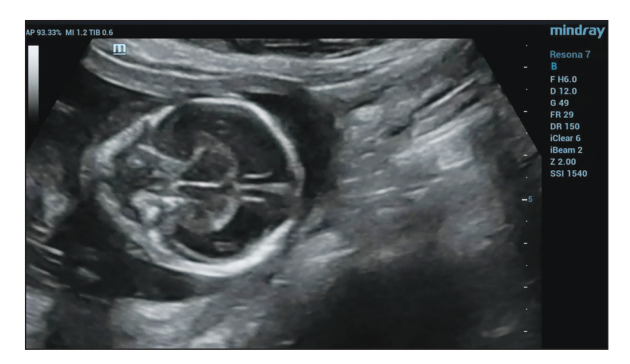
FIGURE 1: Gray-scale ultrasonography at the 16 weeks of gestation, middle interhemispheric variant of holoprosencephaly.

Figure 5 was shared to clarify the distinction of our MIH variant case from semilobar HPE, with this