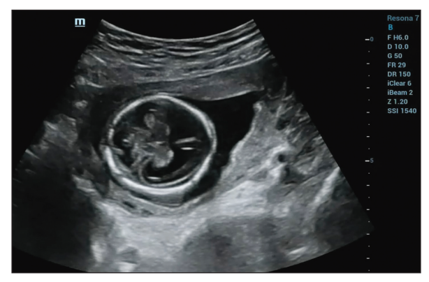
FIGURE 5: Gray-scale ultrasonography at the 16 weeks of gestation, middle interhemispheric variant of holoprosencephaly in axial plane.