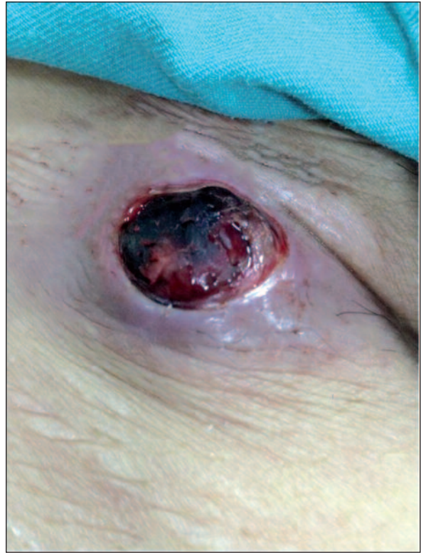
FIGURE 1: Pseudoaneurysm with skin necrosis in the right femoral region.

If it is defined, pseudoaneurysm is a limited haematoma occurred around blood vessels due to arterial injury which is formed as a result of an penetrating or non-penetrating trauma or following a vascular surgery initiative. 2 A fibrous capsule which is ever expanding under the influence of ar-